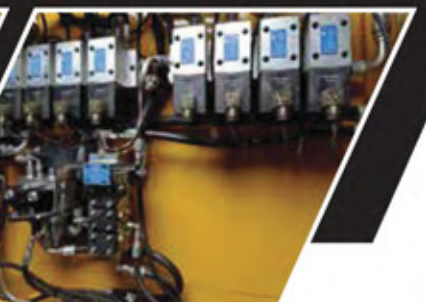
Solenoids & Valves