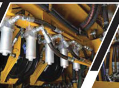
Filters & Hose Reels