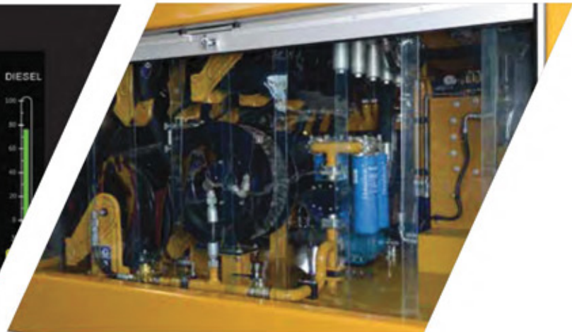
Wireless Fuel/Lube Monitoring