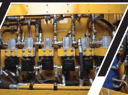
Hydraulic Pumps & Motors